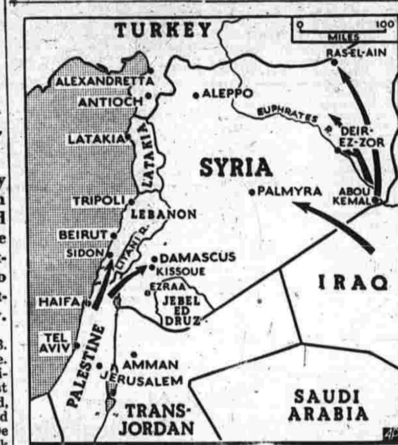
Vichy claimed British and "Free French" forces had been checked in their drive toward Damascus and Beirut (arrows at left). The invaders' admitted encountering stiff resistance. In the north three advancing British columns (arrows) were said to be moving for Aleppo. Aleppo apparently was the objective of these forces.

Syrian Capital Likely To Be Declared Open City When British and De Gaulle's Siege Forces Break Its Outlying Defenses; No Preparations for Fighting in Ancient City. Damascus, Syria, June 13.—1:10 p. m. (6:10 a. m. e. t.)—(P)—This Syrian capital, believed to be the oldest inhabited city of the world, probably will not be defended when and if British and De Gaulle's siege forces break into its outlying defenses. Damascus, it appears, will be treated as an open, or unfortified city, such as Paris itself was declared just a year ago today when German forces were rolling on the center of the French Empire. There has been no preparation for fighting within this ancient city of slaughter. There has been no blackout, no evacuation of women and children to the suburbs. Damascus itself is a population close to 200,000. Damascus is Syria's largest city.